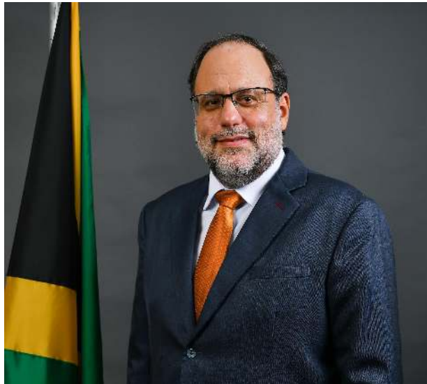
MARK J. GOLDING MEMBER OF PARLIAMENT LEADER OF THE OPPOSITION