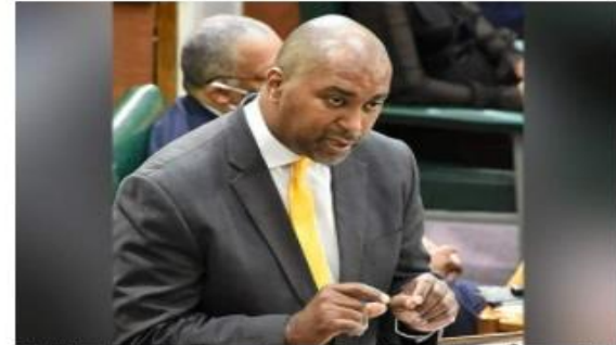
ROBINSON said the efforts employed to support poorer Jamaicans haven't been successful because the government did not use the mechanisms available to reach those in the informal sectors.