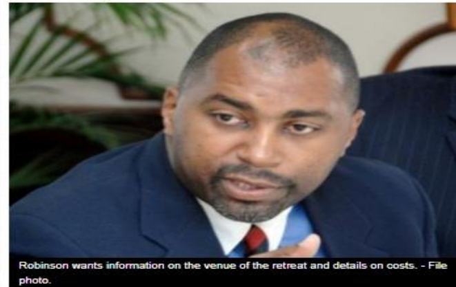
Robinson wants information on the venue of the retreat and details on costs.

Published: Tuesday | November 2, 2021 | 4:23 PM